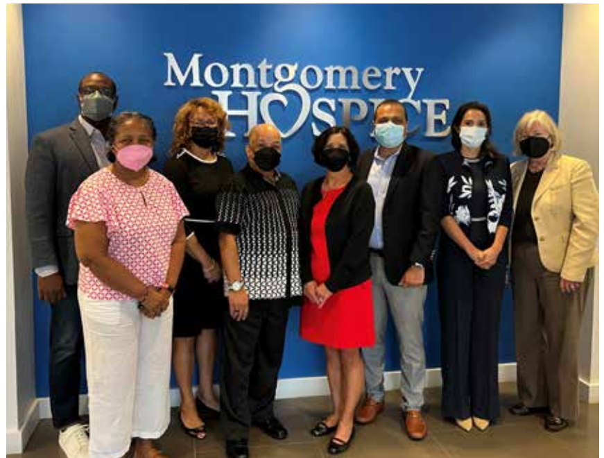
Pictured: Some Board & Life Directors